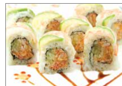
Dinosaur Roll $12