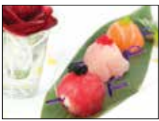
Tri-Color Sushi Ball $8