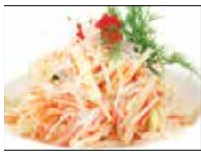
Kani Salad $6