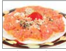
Sushi Pizza $11