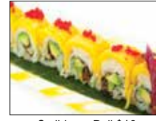
Caribbean Roll $13