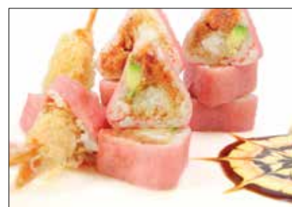
Pink Lady $15