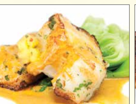
Chilean Seabass $23