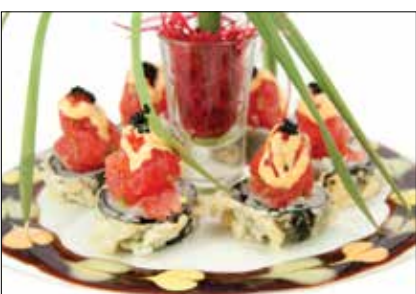
Volcano Roll $14