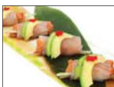
New Style Spicy Tuna $12