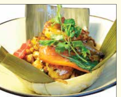
Sambal Delight $17