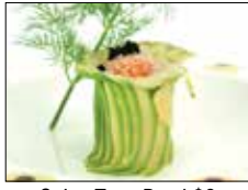
Spicy Tuna Bowl $8