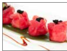
Tuna Shumai $12