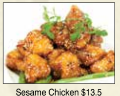
Sesame Chicken $13.5