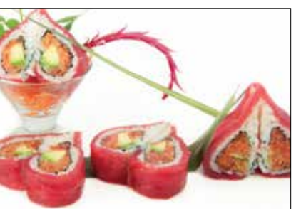
Sweetie Roll $15