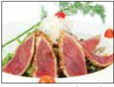
Pepper Tuna Tataki Salad $12