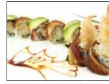
Monster Roll $14