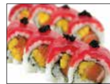
Tuna Lover Roll $14