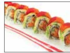
Twister Roll $12