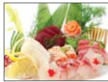
Sashimi Dinner $25