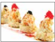
Lobster Roma $12