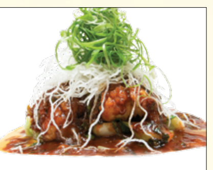
Crispy Red Snapper $20