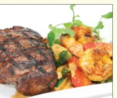
Filet Mignon & Shrimp $23