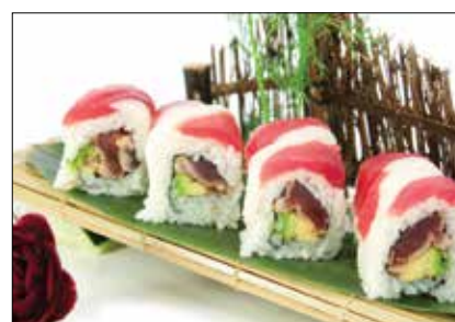
Triple Tuna $14