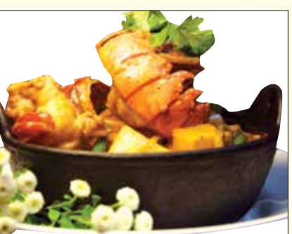
Fire Wok $21