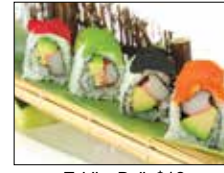
Tobiko Roll $12