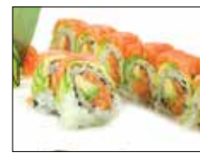
Titanic Roll $14