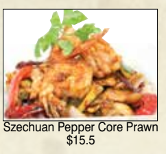
Szechuan Pepper Core Prawn $15.5

Food Allergies? If you have a food allergy, please speak to the owner, manager, chef or your server