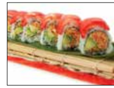
Strawberry Roll $12