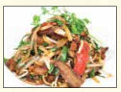
Duck Fajitas Asian Style $16