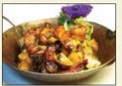
Sambal Prawn $15.5