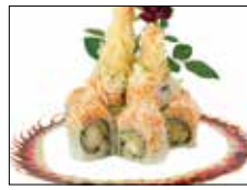
Ten Special Roll $13