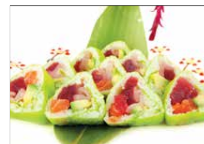
Christmas Tree $15