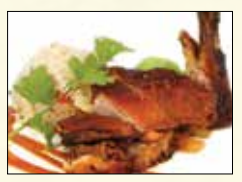
Crispy Duck w. Pineapple Fried Rice $20