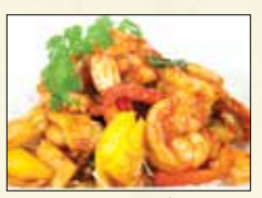
Mango Prawn $15.5