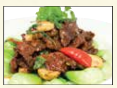
Sliced Flank Steak Basil $16