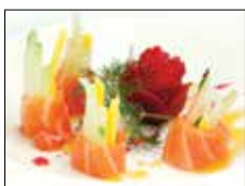
Salmon Mango Salsa $10