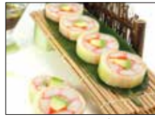
Bansai Tree $10