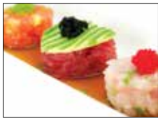
Tri-Color Tartar $12