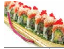
Spicy Girl Roll $12