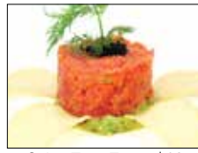
Spicy Tuna Tartar $12