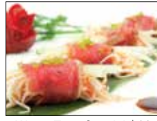
Wawa Tuna Special $12